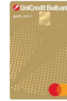
Mastercard Gold Debit APPENDIX 8.1.3