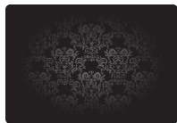
Mastercard World Elite APPENDIX 8.1.4