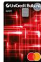
Debit Mastercard APPENDIX 8.1.2 for Payment account with basic features